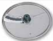
FCS / FCOS