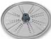
SHSF / SHSG